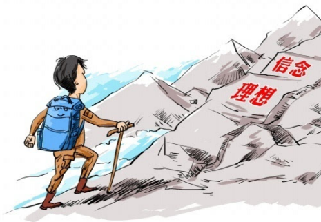
Figure 1 The ideological and political subjects of college students

The classroom atmosphere is boring, on the one hand, it is related to the characteristics of the original subject of ideological and political education, on the other hand, it is related to the way of education of teachers. College students' ideological and political subjects involve a lot of philosophical and historical related content, which is more boring in the process of learning (Fig.1). From the specific content of education, the content of Marxist principle in college students' ideological education is rather obscure and difficult to understand. Only when students have fully grasped this part of the content, can they apply it correctly in real life [2]. It is not easy for students to fully understand this part only through the teacher's narration in class, and students need to further understand it through other information after class. For example, when studying this part of the outline of modern Chinese history, students cannot make a correct judgment on the whole historical event only through the expression of the textbook and the teaching of the teacher. Students need to take the initiative to understand the relevant historical background knowledge. Teachers can only guide students in the classroom in education and teaching activities, teachers need to promote students' interest in ideological and political subjects through the classroom, help students form the consciousness of active learning, and arouse students' enthusiasm for learning.